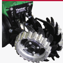
2967 SHORT, FLOATING RESIDUE MANAGER Wide and narrow models