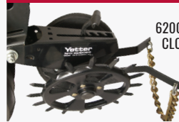
6200 CAST SPIKE CLOSING WHEEL Drag Chain optional