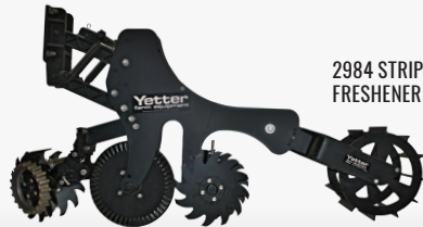
2984 STRIP FRESHENER