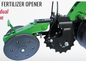
2968 ROW-UNIT MOUNT IN- BETWEEN FERTILIZER OPENER Single or dual application